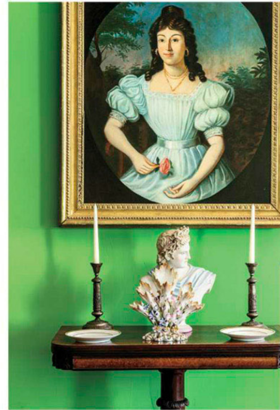
LEFT: Full Spectrum Paints' Albania Verdigris was chosen for a bedroom with southern exposures at Slonem's Albania Plantation in Louisiana. RIGHT: A chair at Cordts Mansion is covered in a Kravet Couture velvet.