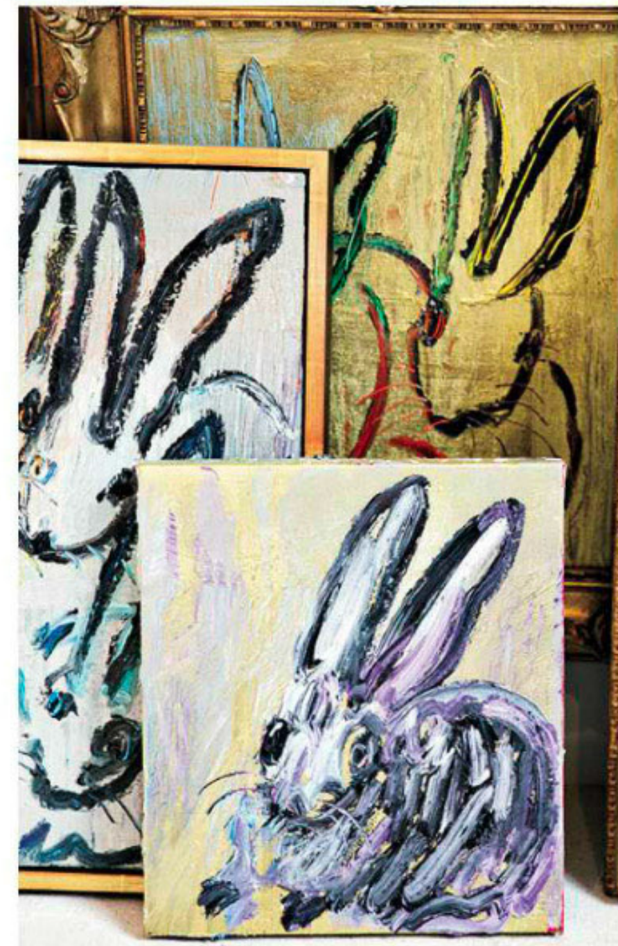
LEFT: An assortment of Slonem's iconic bunny paintings. RIGHT: Full Spectrum Paints' Giverny Green in the guest bathroom of Slonem's New York City studio was inspired by the color of the shutters at Monet's retreat.