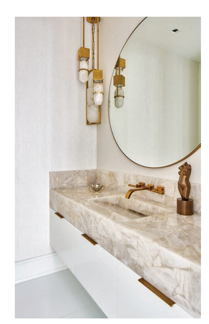
Wrapped in glass-beaded wallpaper, "the powder room is the jewel of the house," Gerts says. The integrated marble sink "mixes beautifully with the brass finishes and sconces."

SOURCES Overall: interior design, House of Style & Design in Holmdel; contractor and all millwork, Merrick Construction Inc. in Little Silver. Foyer/Entryway: wall color, "Decorator's White" by Benjamin Moore. Dining Room: custom furnishings and accents, House of Style & Design. Kitchen: collaboration between House of Style & Design