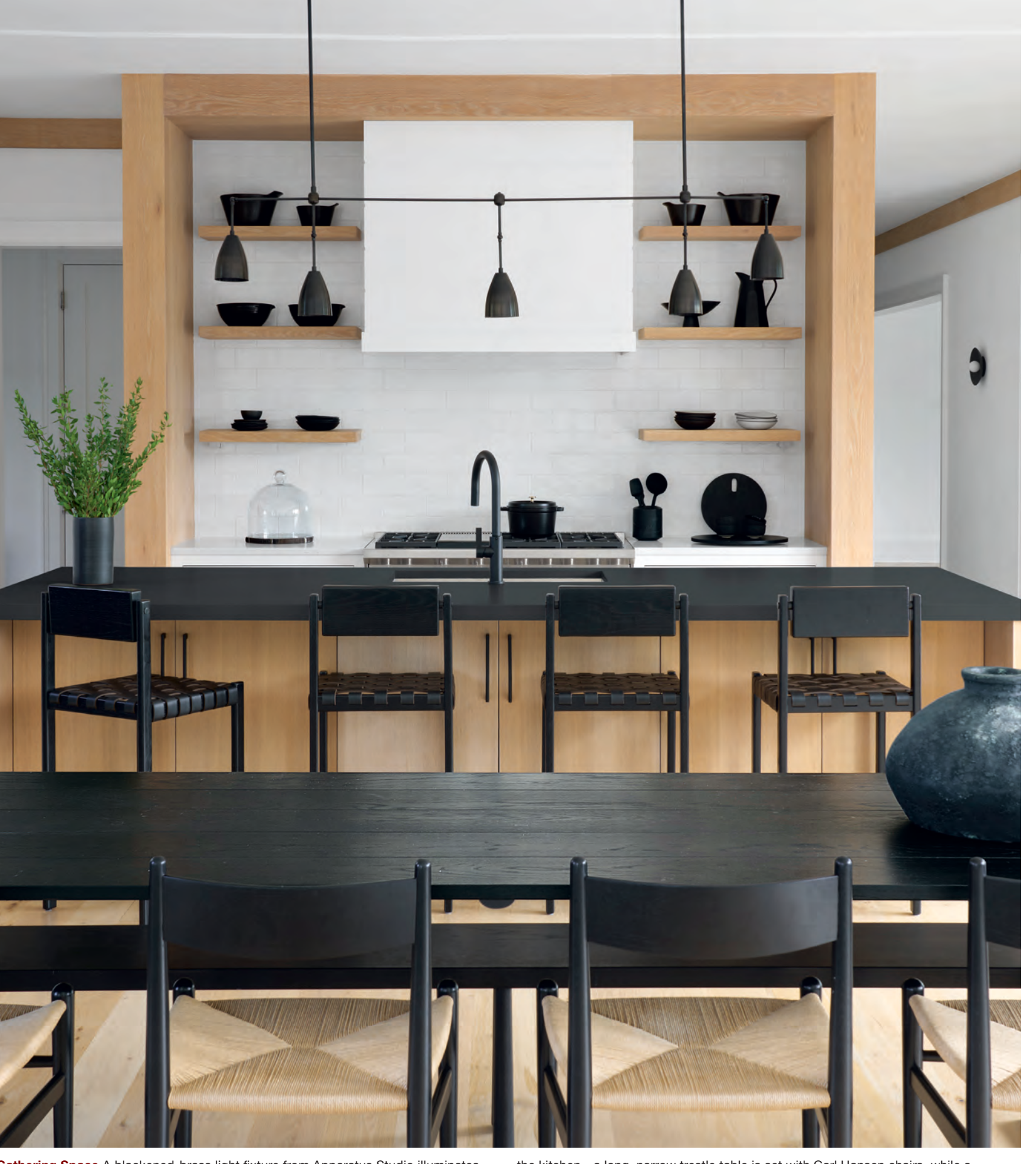
Gathering Space A blackened-brass light fixture from Apparatus Studio illuminates the kitchen island (ABOVE). In the family room (OPPOSITE PAGE)—which melds with